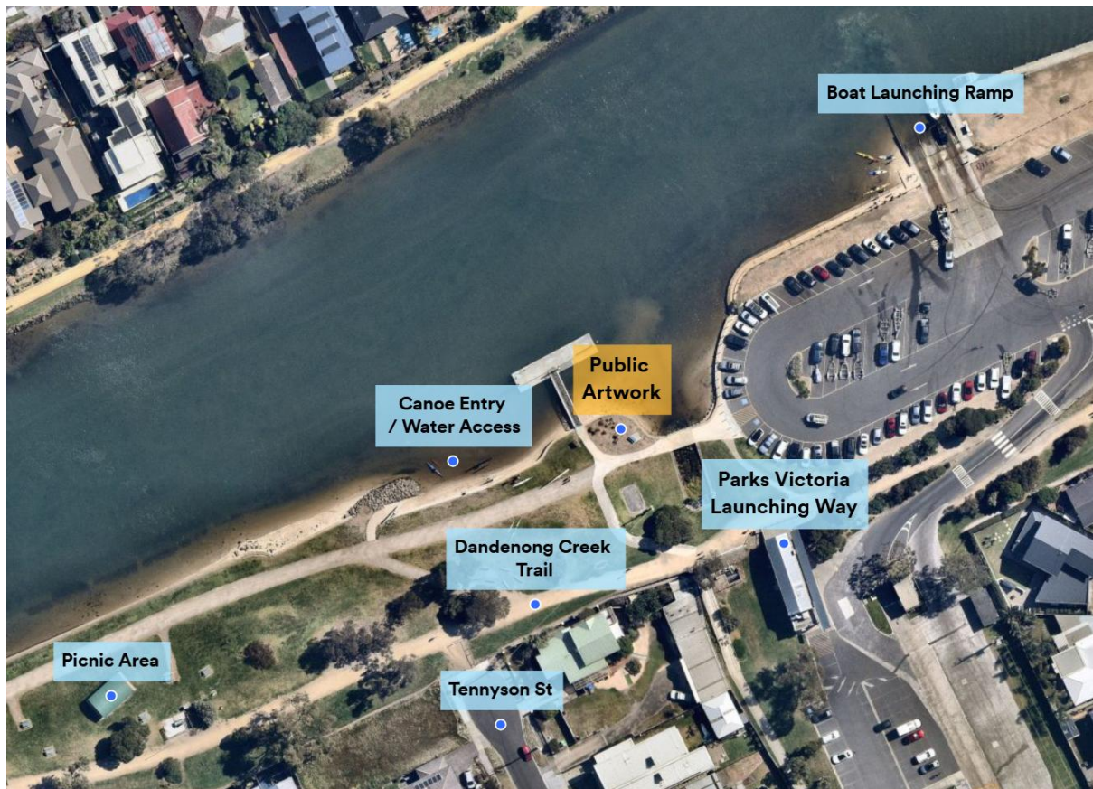
Figure 1: Aerial view of identified artwork location – Patterson River, Launching Way, Carrum VIC 3197