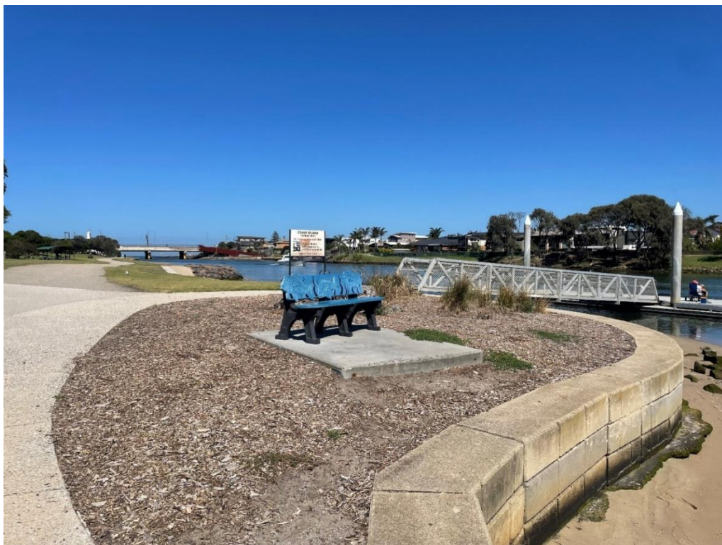
Figure 3: Existing artistic bench

An existing artistic bench seat will be removed and relocated to another suitable location within the area to make way for the new installation. While the use of the existing concrete pad is welcomed and encouraged—particularly if it can be creatively integrated into the design or be used as a structural footing - it is not a mandatory requirement. Artists are welcome to propose alternative foundations or placements that best support the intent and functionality of their concept.