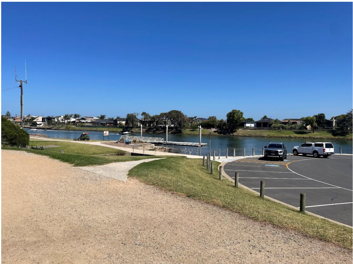
Figure 4 & 5: Site Images