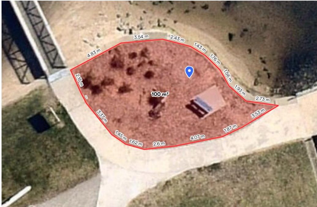
Figure 2: Aerial view of identified artwork location

An existing artistic bench seat will be removed and relocated to another suitable location within the area to make way for the new installation. While the use of the existing concrete pad is welcomed and encouraged—particularly if it can be creatively integrated into the design or be used as a structural footing - it is not a mandatory requirement. Artists are welcome to propose alternative foundations or placements that best support the intent and functionality of their concept.