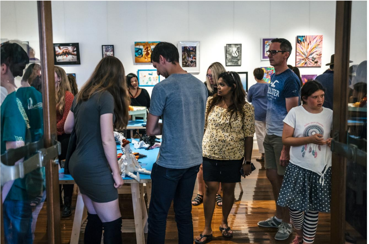
Image: Artz Blitz 2019 Opening event