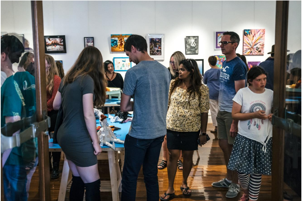
Image: Artz Blitz 2019 Opening event