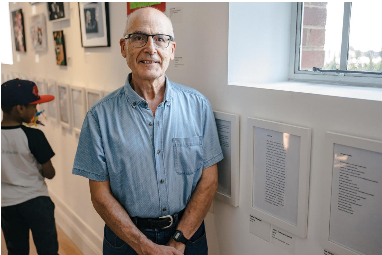
Image of Artz Blitz 2019 exhibition opening