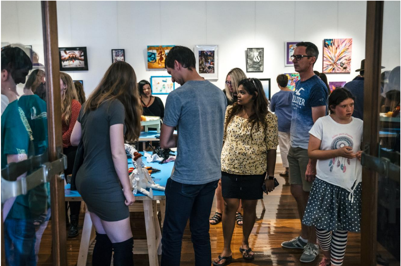
Image: Artz Blitz 2019 Opening event