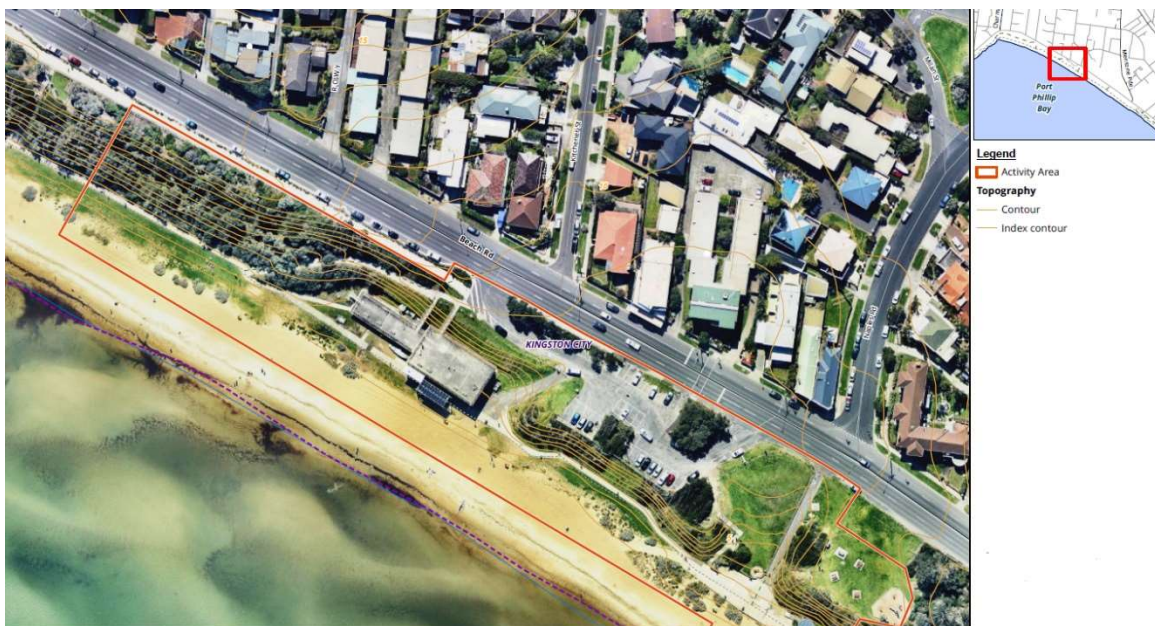
Image 2: Site of the redevelopment of the Mentone Lifesaving Club, Aerial Photo

There is an expectation that the artist will undertake some form of community consultation or engagement local residents, key stakeholders, LSC users and local schools etc.