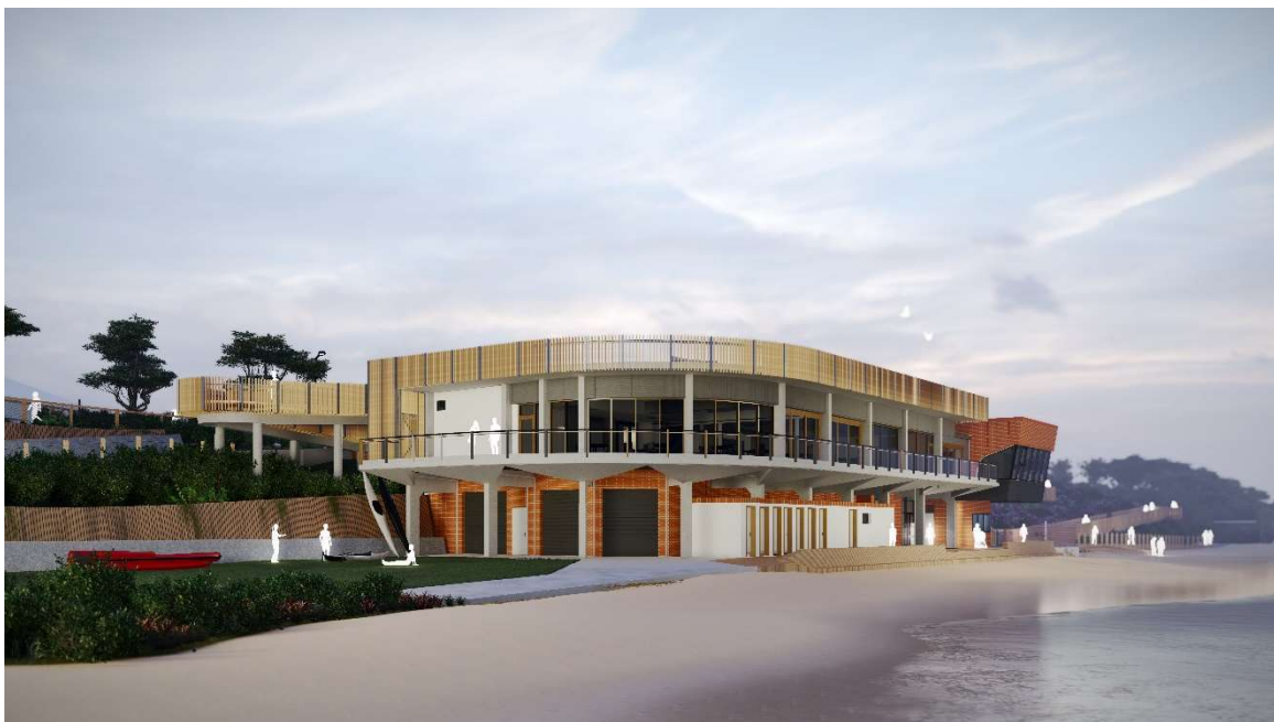
Image 1: Mentone Lifesaving Club Redevelopment and Precinct, 3D renderings.